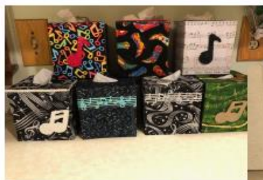
TISSUE BOX COVERS